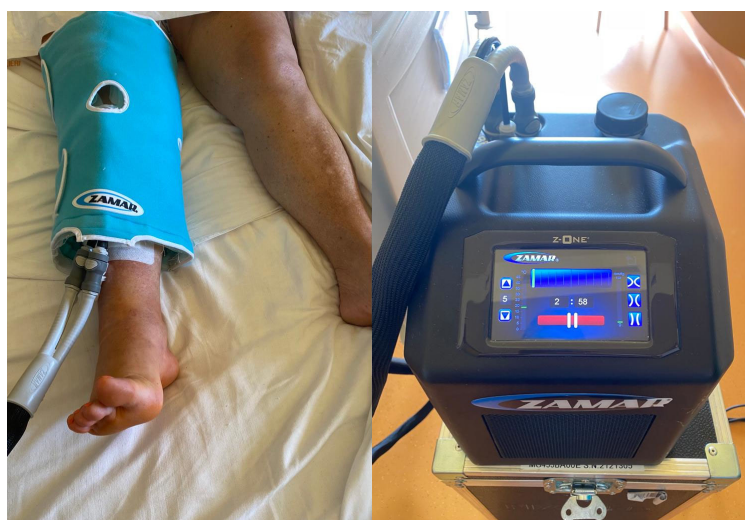
Figure 1. Application of cryotherapy pad on a patient.

Cold therapy for pain reduction is an accepted and frequently used treatment in daily practice after trauma or surgery. It involves the application of cold to the skin surrounding the injured soft tissues and in joint surgery is supposed to reduce the intraarticular temperature [10] (Figure 1). It is supposed to reduce the local blood flow by vasoconstriction, swelling, and pain experience by slowing the conduction of nerve signals [11,12].